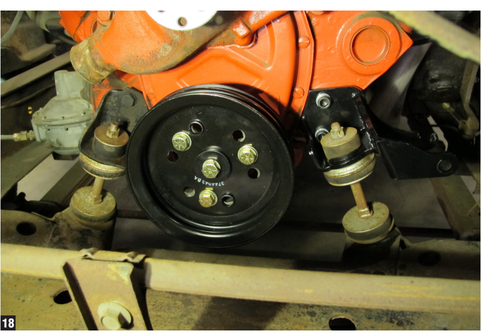
15. Install new pulley(s) and secure with new balancer bolt, spacer, and lock washer. (Fig 18)