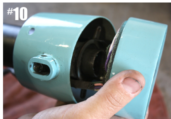
Figure #10 & #11

Re-install the turn signal housing to the column. Line up the slots