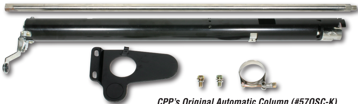
CPP's Original Automatic Column (#570SC-K)