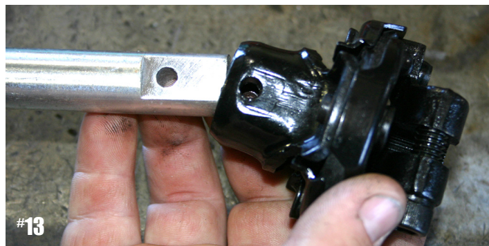
Figure #13 & #14

CPP column shown all assembled with the factory shift collar and turn signal housing.