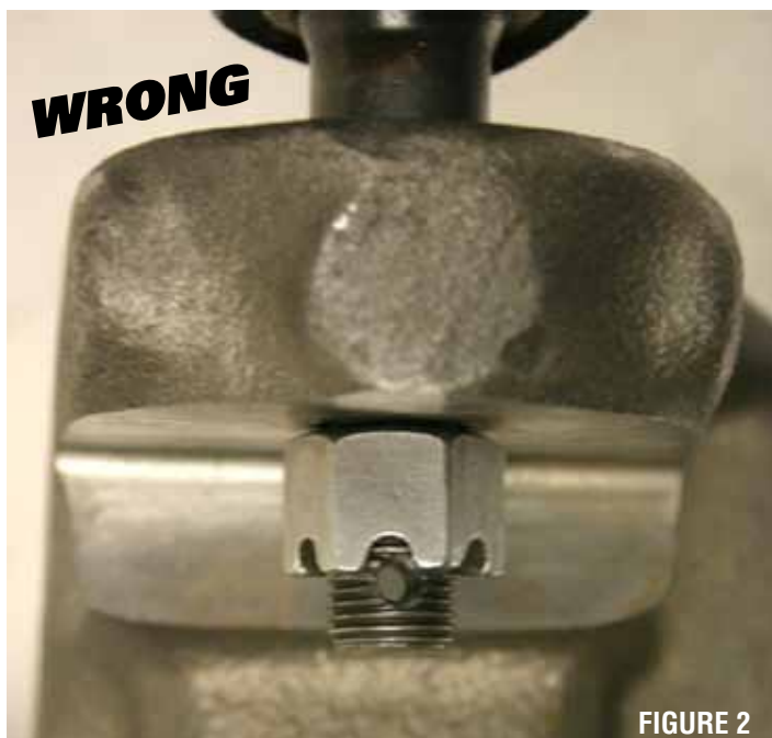
Washer not used and cotter pin holes mis-aligned with slotted nut.