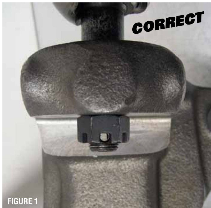
No washer used and cotter pin hole properly aligned with slotted nut

Refer to Figures 1 and 3 for correct alignment.