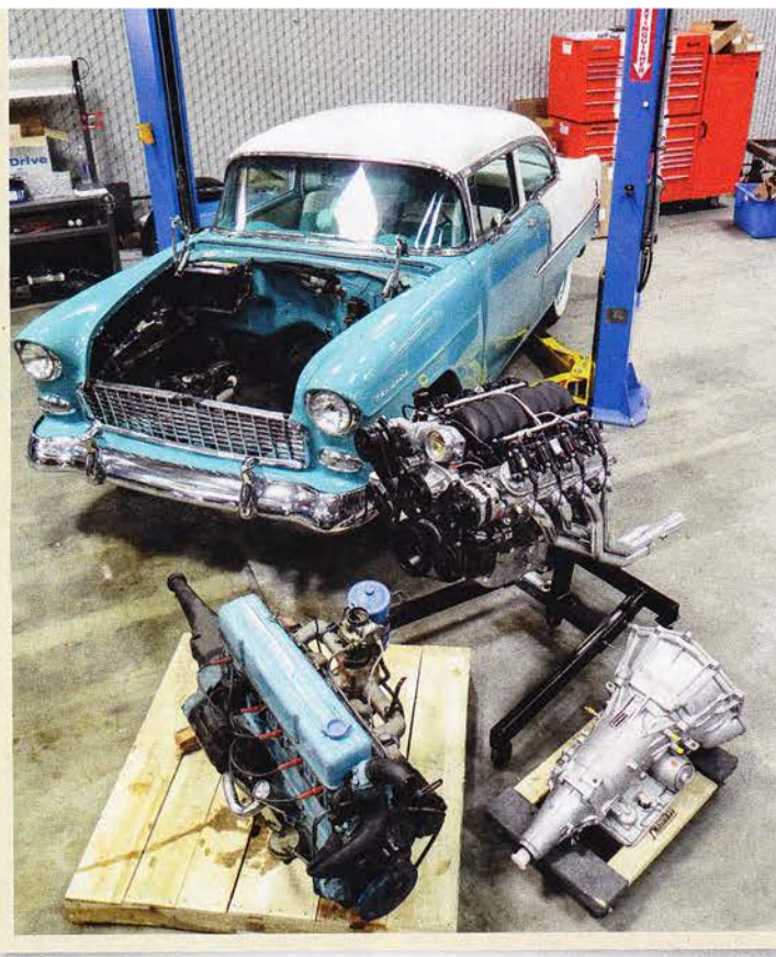
◆Direct from Chevrolet Performance: the Connect & Cruise LS3—430 horses of 6.2L V-8 goodness—complete as shown, including engine management system and 4L65E overdrive transmission.