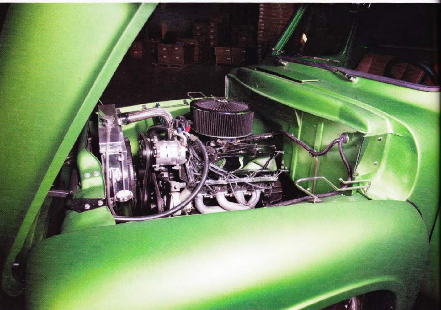
A TRIED-AND-TRUE 351-CI CLEVELAND ENGINE WAS SHINED UP AND DROPPED IN TO POWER THIS BEAST.